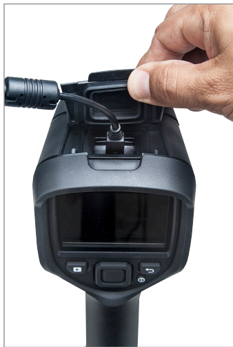
Download images fast via USB

Specifications are subject to change without notice. For the most up-to-date specifications, go to www.flir.com