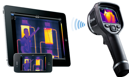
Wireless Connectivity to Smartphones, Tablets and more.