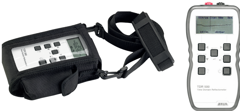
Example: TDR 500