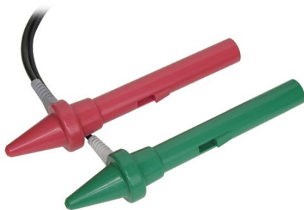
High voltage output probes

Other voltages and ratings for this unit are available as special products on request. The picture overleaf shows a KV4-300, a unit with a 4kV, 300mA rating. Units have also been supplied with a 3kV 250mA rating. If you would like a quote for your specialist requirements, please contact us.