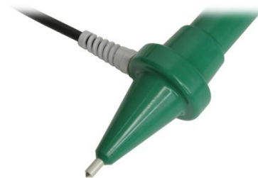
Output probe tip

Note: Due to the company's continuous research programme, the information above may change at any time without prior notification. Please check that you have the most recent data on the product.