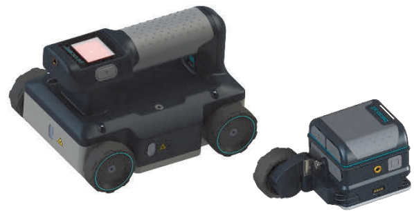
GP8000 | GP8800